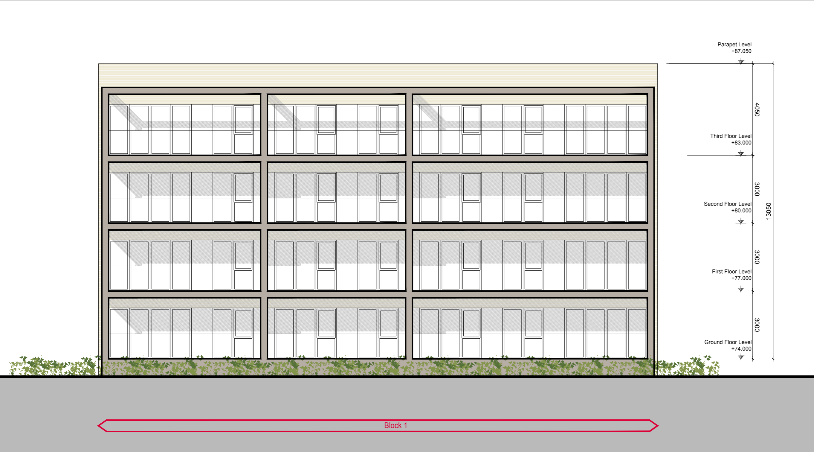
BLOCK 1 ELEVATION 01- FACING NORTH WEST