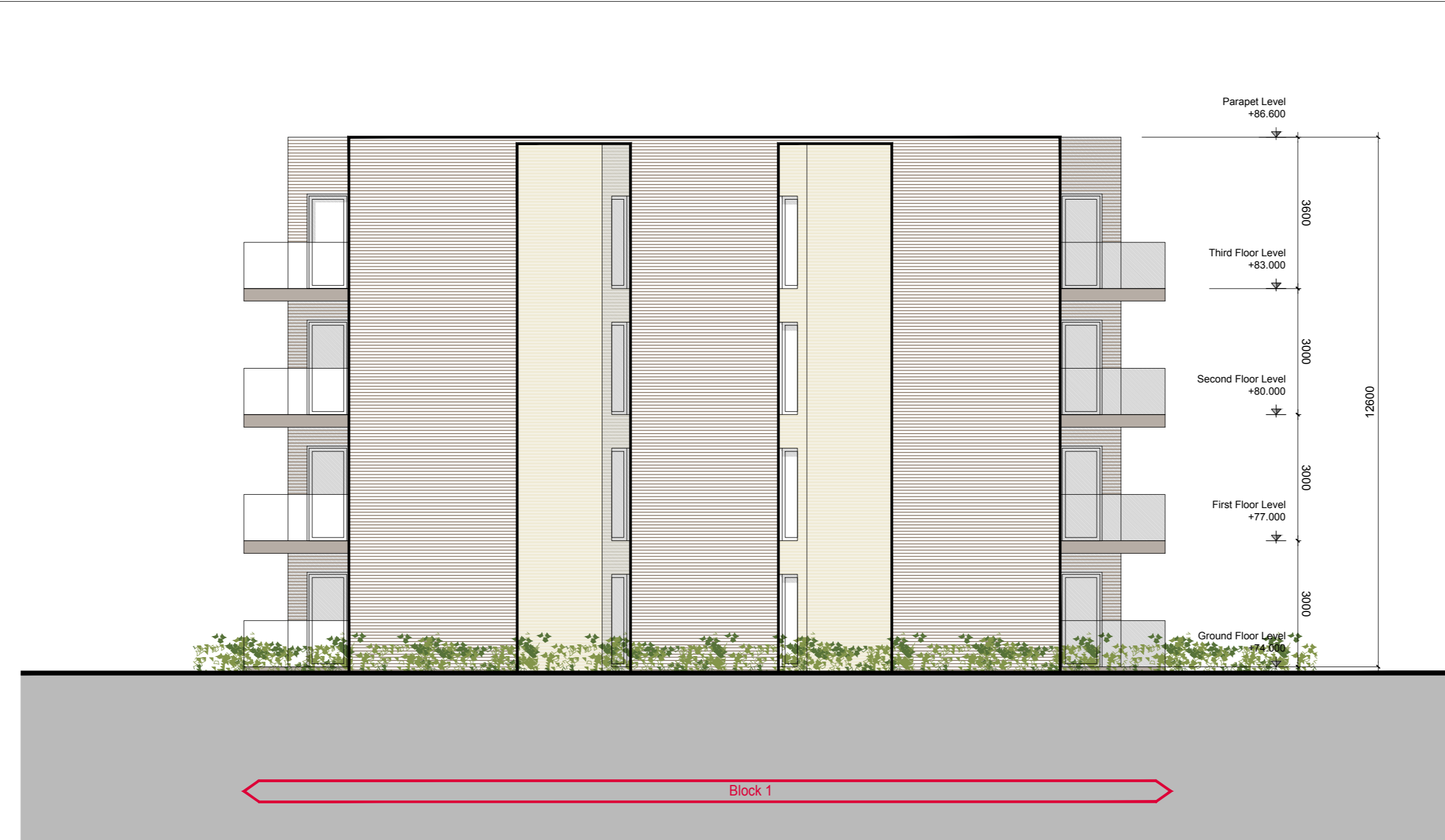
BLOCK 1 ELEVATION 02- FACING SOUTH EAST