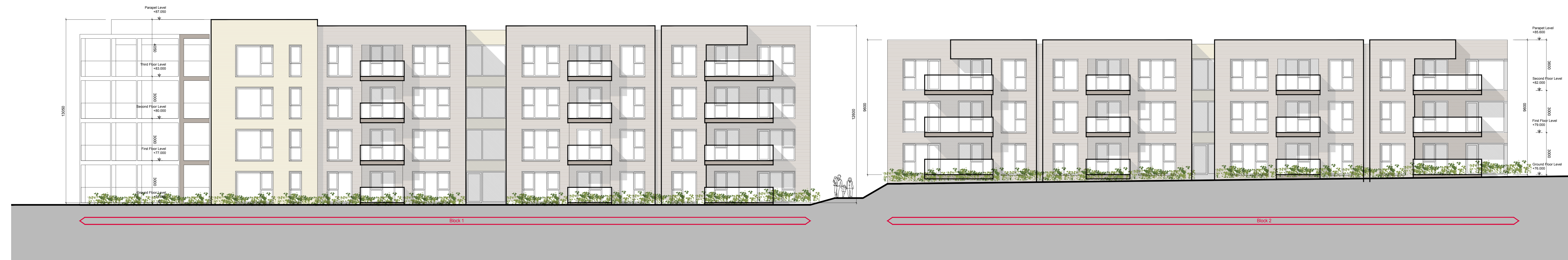
BLOCKS 1 AND 2 ELEVATION 03- FACING SPINE ROAD